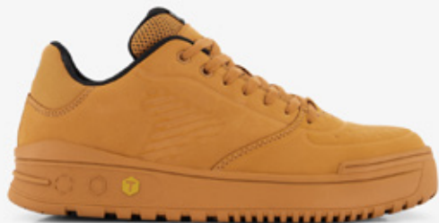
DENTON WHEAT S1P CI HI HRO SRC | 2045-020 | 39-46