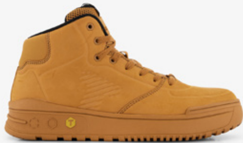
DENTON MID WHEAT S1P CI HI HRO SRC | 3045-020 | 39-46