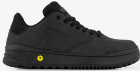
DENTON BLACK S1P CI HI HRO SRC | 2021-001 | 39-46