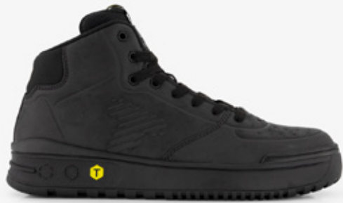
DENTON MID BLACK S1P CI HI HRO SRC | 3021-001 | 39-46